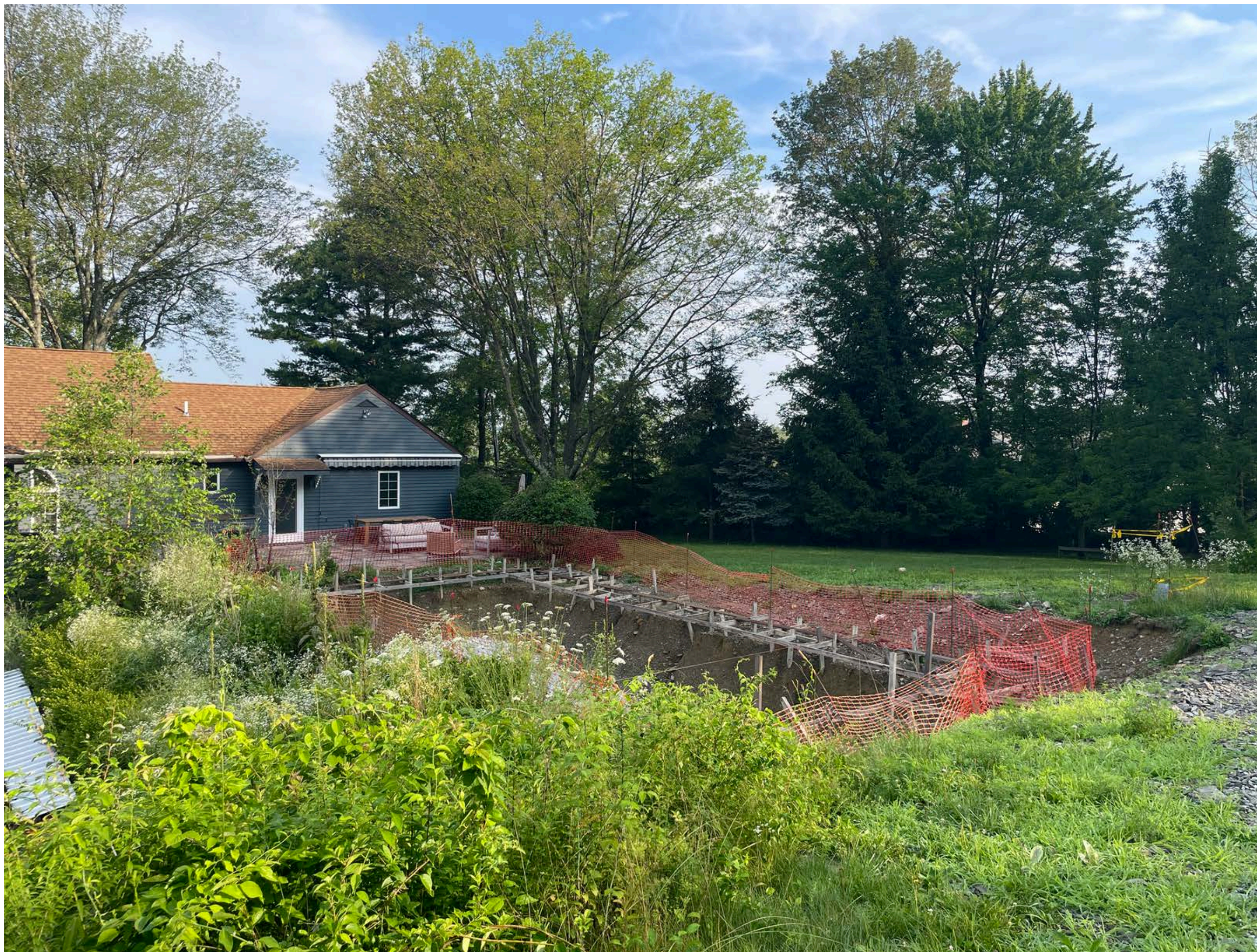
Secondary view of the same property line showing dense coverage between the two property lines. Lines of thick pines and trees and bushes and shrubs.