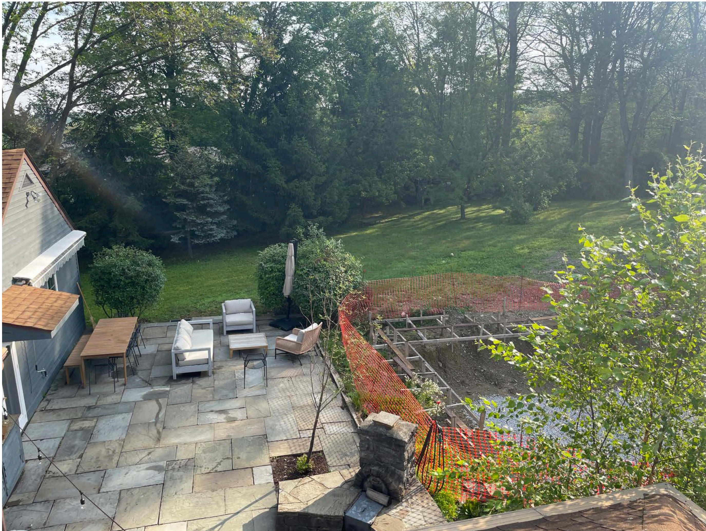
Image from 610 Stanford Road roof looking at the side yard that is shared with 620 Stanford Rd. Virtually NO views of the neighbors property aside from small parts of their roof.