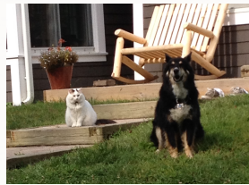
Mavi and Cary in front of the Little House classroom.

It supports them in becoming decent human beings in an increasingly complicated world.