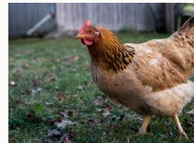
Francis comes running for scratch.