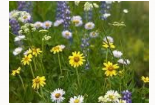
Wildflowers in a nearby field.

The FAFA curriculum is designed to make kids think. It is designed to get them outside in nature and moving their bodies.