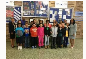
5th grade scholars from PMS.