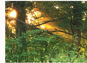
Sunset on the farm.

Academically gifted students are capable of performing at a higher intellectual level than others of their same age, experience, and environment. Gifted students come from all racial, ethnic, and cultural populations, as well as all economic strata.