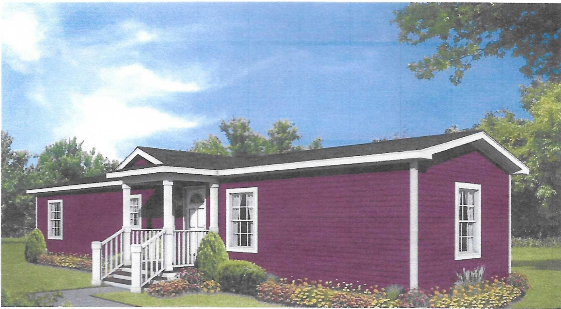
Shown with site-built porch by others