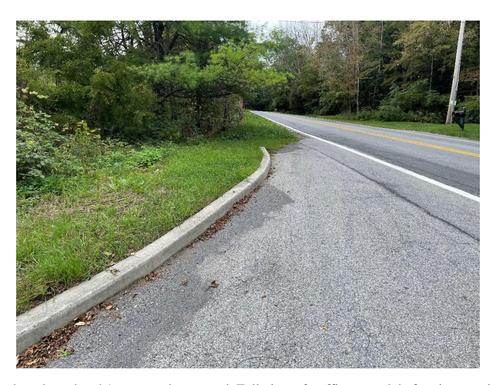
South curb cut brush/tree growth removed. Full view of traffic to south before intersection.