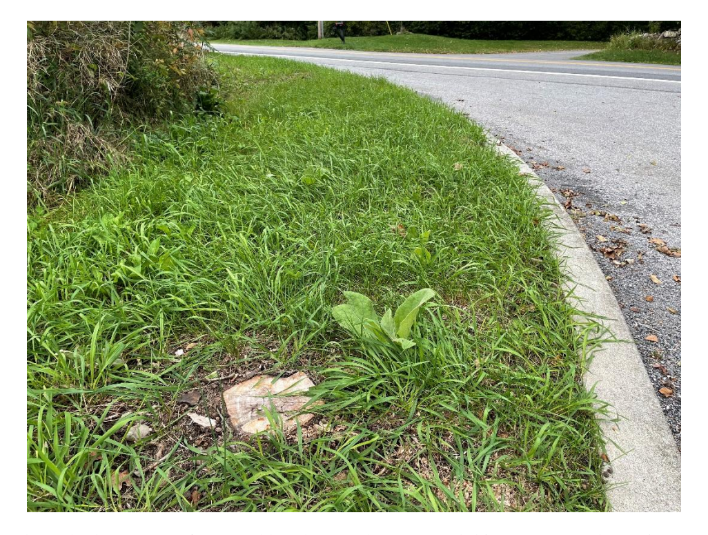
Curb cut had 15 years of tree and brush growth. Removed this summer and now in grass.