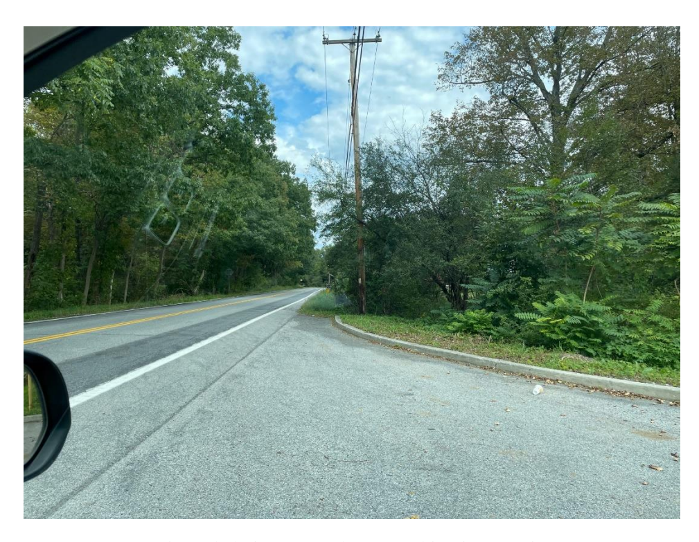
Unimpeded view to north approaching intersection.