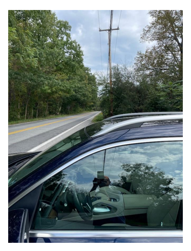
Driver side view to north now unobstructed.