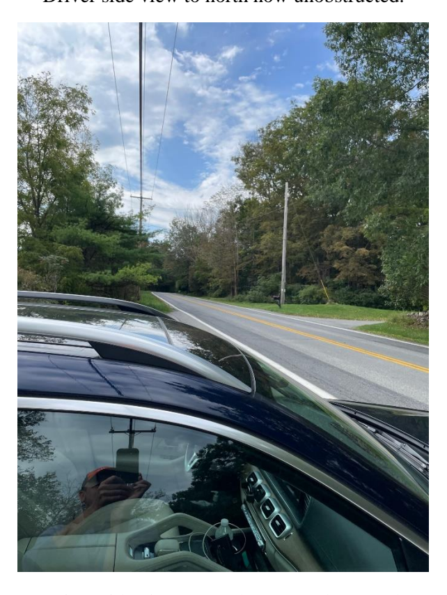
Driver side view to south now unobstructed.